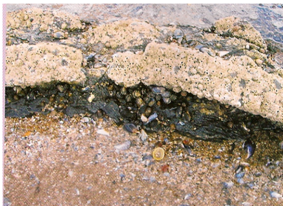
This is one of the many layers of coal in Joppa Rocks. The thicker seams have been dug away; the thinner ones are usually hidden under silt and sand.

Joppa Rocks forms one end of the 'Midlothian Syncline' – a gigantic bowl-shaped feature, many miles across – which was formed when the land was squeezed by tectonic forces as land masses jostled into one another. There is an information board which describes the local geology in detail, in the grassy area above the rocks, immediately to the West of the little cluster of buildings that includes the Rockville Inn.