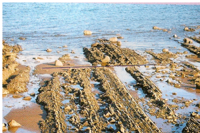
These rocks have not only been tilted way over, but have been dislocated along a fault line

Joppa Rocks were laid down in layers which were subsequently tipped over by about 45° in a massive upheaval, and the ends of the layers eroded away. As you walk eastwards towards Musselburgh you are effectively walking upwards through some 20 million years of history.