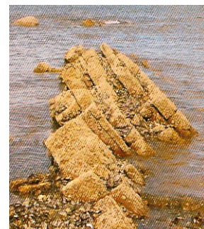
This sandstone bed stands out in clear relief, the softer underlying mudstone having been eroded away

into layers of peat which eventually turned into rich deposits of coal. After a while the sea would break in again, and the whole cycle would repeat, leaving another set of layers in the Joppa Rocks.