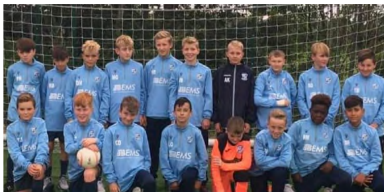
Portobello Football Academy Under 14s.