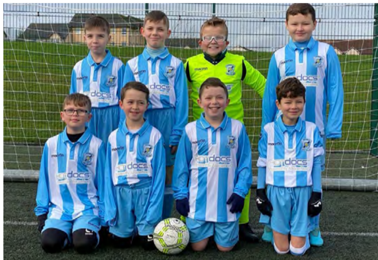
The 2010 7-a-side team in their new strips.