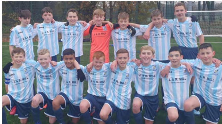
Portobello Football Academy Under 13s.