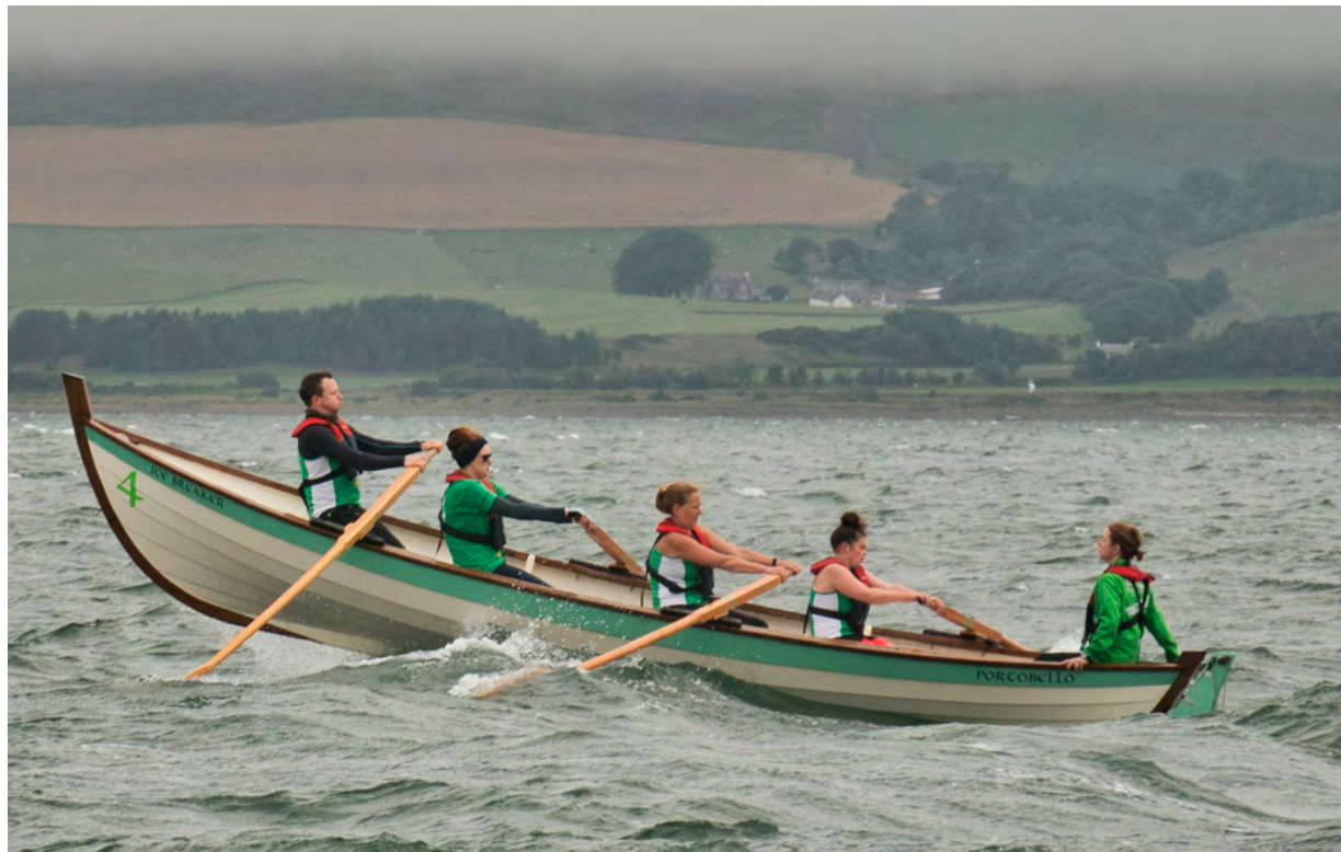
Rowporty Open A Mixed crew.

TWENTY-SEVEN RowPorty members attended the SkiffieWorlds 2019 coastal rowing championships in Stranraer and Loch Ryan from 7th to 13th July. We entered as many categories as our club demographic would allow - men, women and mixed crews in the 40+, 50+ and 60+ age groups, and Open categories of all ages for men, women and mixed.