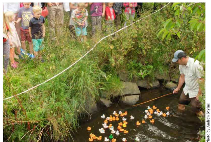
The ever popular duck race in the Figgate Burn attracts a crowd.