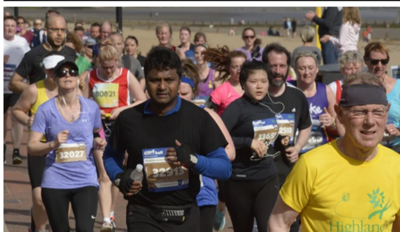
Just a few of the many thousands of runners that took part in this years Edinburgh Marathon Festival as they race along Portobello Promenade in the half marathon event. The results of this years races can be found at www.edinburghmarathon.com/results .