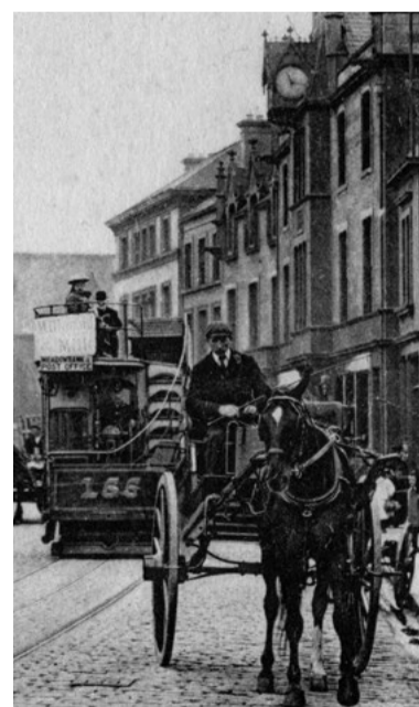
The clock in place circa 1900

Costings for the repair and reinstatement of the clock are being prepared by the council, and they will contact the church to discuss reinstatement and preparation of an agreement for council responsibility for the future maintenance and insurance of the clock. Portobello Heritage Trust and Portobello Amenity