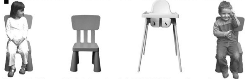
Blossom Day Nursery 15b/c Bath Street, Portobello 0131.657 2233 www.blossomdaynursery.com