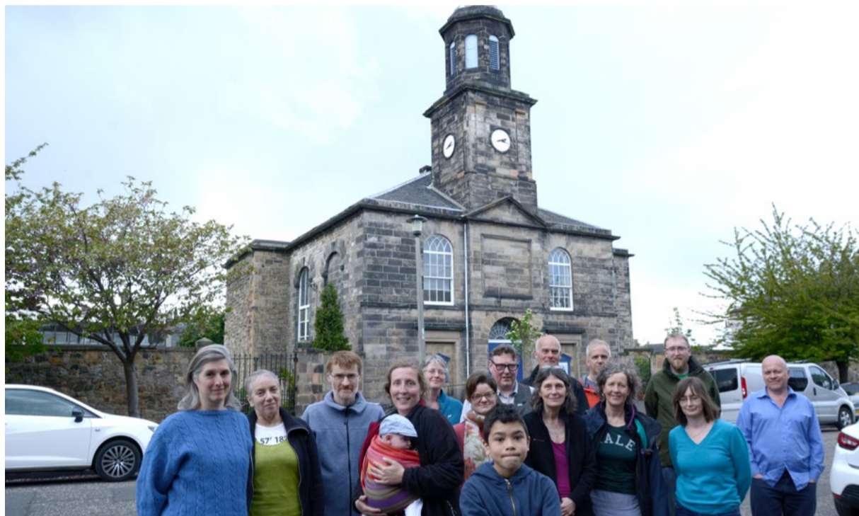
Friends of Bellfield gather outside the church they hope to acquire for the community.

Luckily, in the fortnight before the public meeting, the Scottish Land Fund (intended to help fund communities to secure vital assets), and also