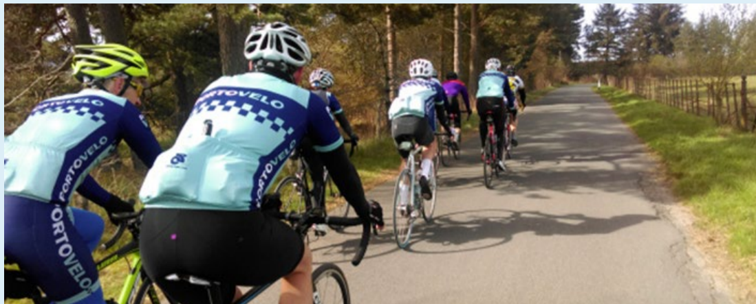
A beautiful sunny day as the cyclists pedal alongside Gladsmuir Reservoir.

PORTOVELO , the Portobello cycling club, is now four years old. In that time, it has built up a core group of perhaps 25 riders who turn up regularly for Sunday rides, plus many others who come along occasionally. It's a great way to explore the countryside and get fitter, in a friendly and supportive atmosphere. We always welcome new members - all you need is a road bike and a willingness to give it a try. If the weekly "fitness" rides are longer or faster than you are looking for, you could try one of our leisure rides on the first Sunday of each month. Like the fitness rides, these are led by an experienced cyclist who can manage the pace to suit a range of abilities, and include a café stop. We also organise occasional family rides, suitable for all ages and abilities - a great way to get the children out on their bikes!