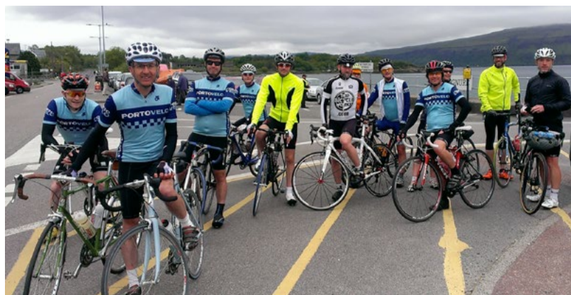
Portovelo club members at the ready for the start their tour of Mull at Craignure.

IT has become a tradition for local cycling club, Portovelo, to have an annual weekend trip away in June. We have a great choice of routes on our doorstep, but it's good to venture occasionally further afield. Previous trips have been to Stirling and Aviemore, but this year a group of 14 riders went up to Oban for two days of great cycling in some stunning scenery. On the Saturday we got the ferry over to Mull and rode most of the way round the island, enjoying some beautiful coastal scenery.