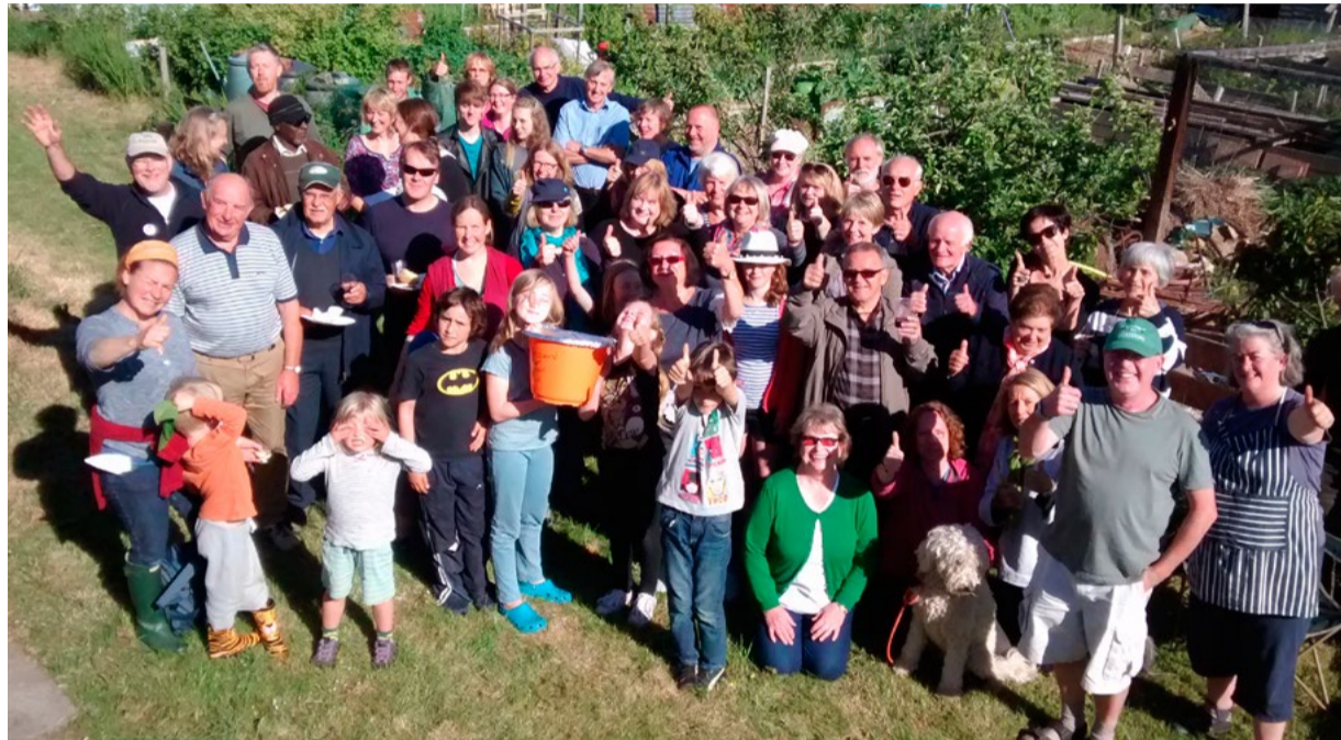
Craigentiny & Telferton Allotments plot holders show their solidarity in opposition to the developers.

1923 by a local man, who approached Edinburgh Corporation for permission to use an area of land as allotments. For over 90 years they have been worked and managed by people from the surrounding area as an independent allot-