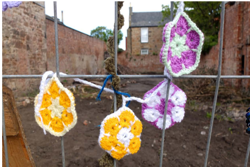
Knitted flowers adorn the fence that bars the way to the now demolished Electric Bungalow Garden.

MEMBERS of The Electric Bungalow Community Garden, the volunteer project on the vacant lot in Bath Street, say they were shocked to discover bulldozers levelling the beds they had planted and the pizza oven they had built on Thursday 15th May. The demolition team allowed them to remove their tools but not to save any of their plants or their pizza oven.