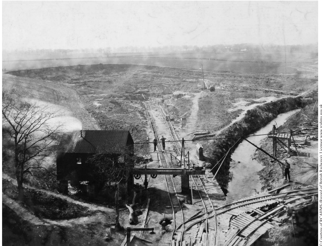
The clay pits, in about 1900, at one end of the overhead cable system which carried the clay from the clay beds to Portobello.

Gradually the surrounding area was built