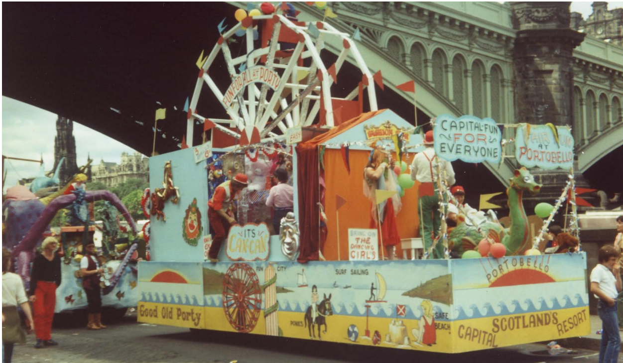
HAfYya UmVYbc 9X]bVi f[\ : Yghj U 7Uj UWXYh jgnUfZVi hk YWb'gY\ fYUcUUhYbMfYX'Vm DcflcVY'c ]b'hAY%, 'Sg'HU_Yb'i bXYf'B cfh '6f]X] Yzh jg'd'cfc'g'ck g'k \Uhb'VYdfcXi WX'Vm \UXk cf_]b[ 'Wa a i b]mia Ya Vf'g'