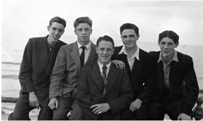
ja 'Ca UfXyGm]Vyg'h jg[ fci d'cZnci b[ 'a Yb Ug'DcflmFVYg'N H jg'd'cfc[ fUd\ 'Zca 'Uci bX%) S'k Ug'dfcVUv'miU_Yb'cb'U G bXUmUZMbccb'k \Yb'hAY a Yb'dfca YbUXYX ]b'hYf'g ]lg'Zca '6Ua 'GfYHic'>eddUFcWg'z'h Yb'VUW'Ucb[ 'lc'GYUYX'VZcfYfYh fb]b[ 'lc'6Ua 'GfYH' H'YhXY ]g]b'k \Wz'ja 'g'Ug'z a Yb'h'h Ym'Wi 'X'bchid'Um'h Yf'i g'U '[ Ua YcZZ'chU'cb'h Y VUW' H'Y'DcflmFVYg'N'UfYz'YZhc'f][ \h'ja 'Ca Ufz'Ha a mi 8'f'Wz'UW'mi-bbYg'z'Ha a miA cf[ U'b'U'X'6]'mi8 Ya dg'mh