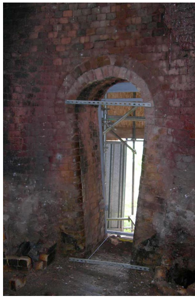
Doorways will be secured

THE completion of make-safe and investigatory works allowed the architect and structural engineers to identify what further consolidation measures were required. These include: recording, numbering, dismantling and placing into safe storage the fireboxes in the 1909 kiln; removing vegetation growth on both kilns, carefully raking out and repointing with approved mortar where necessary; blocking off