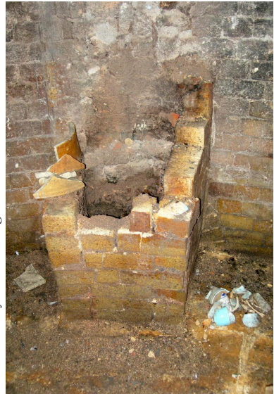
Fireboxes will be removed for safe storage

wall-vent openings to stop pigeons roosting; repairing existing metal strappings where required on both kilns to provide structural support and replacing the missing topmost strap on the 1906 kiln. The partially collapsed 1909 kiln will also have to be provided with an approved wallhead cope to protect the wallhead from