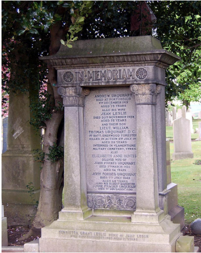
The Urquhart family memorial in Portobello Cemetery.