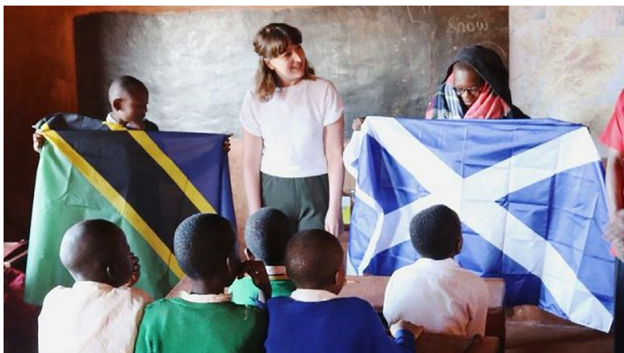
Msufini pupils learn about Scotland