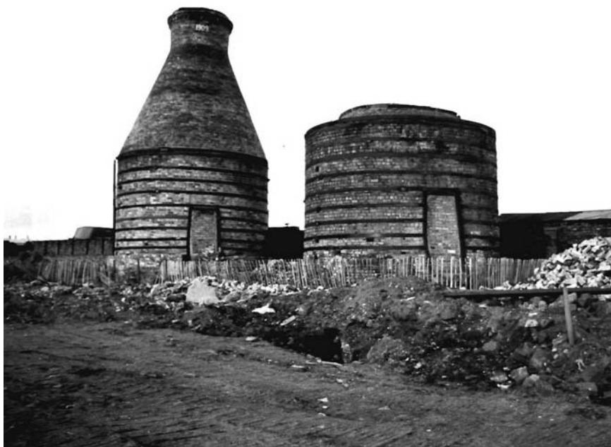
The Portobello Kilns in the 1970s: the 1906 kiln is awaiting repair while the 1909 kiln is still in good condition.

Not surprisingly, this application has generated a very large number of objections. Due to this, it is expected that no decision about it will be made until the start of next year.