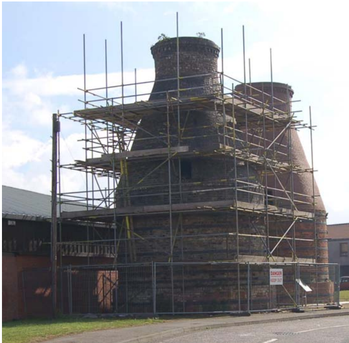
The Kilns just before the collapse of the 1909 kiln.

The initial remedial work by the structural engineers has been completed. An investigation of both kilns was undertaken to determine their condition and decide on any repair work required for the 1906 kiln.