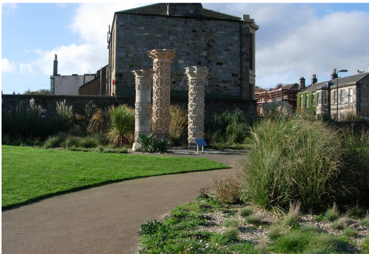
The John Street Community Garden.