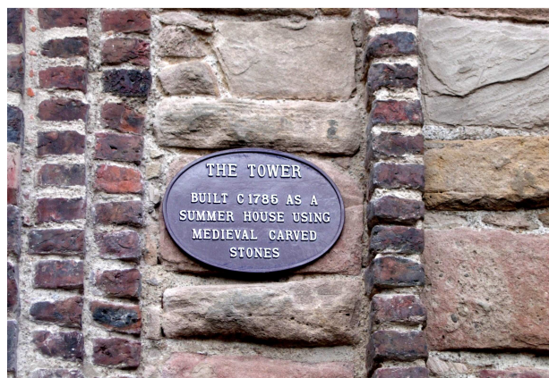
The New Plaque