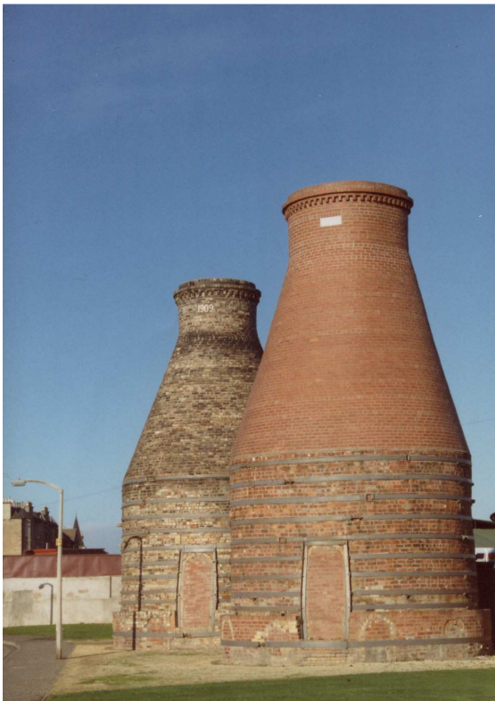
The Kilns in their pristine state.

The Heritage Trust grew out of the Kilns Working Group, comprising three members of Portobello History Society, which actively engaged with the Council to ensure that the rebuilding of the kiln would be taken forward. Whilst working with council officials on this, the planning application for the Fun Park Site development was submitted and the working group was encouraged by officials to request a space for community use within it. The approach from the working group received a positive response and its members are now working with the architects to clarify the size of the space before deciding on its future use.